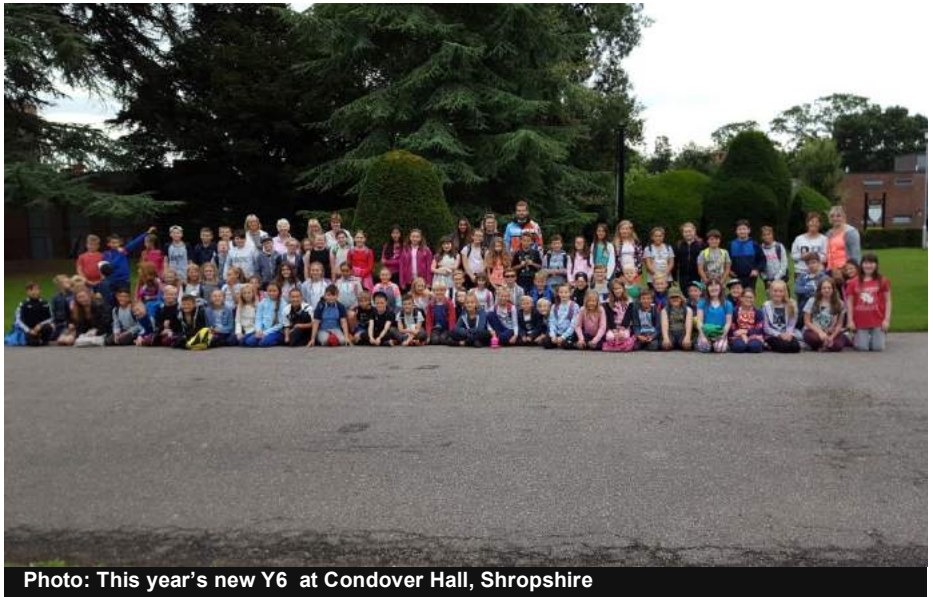
Photo: This year's new Y6 at Condover Hall, Shropshire

The trip was a brilliant way of promoting a number of skills including: safety skills, developing friendships and learning more about people we don't normally hang out with. With this skill, lots of new friendships were made.