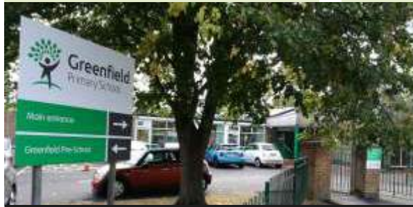
Greenfield Primary continues to be a good school.

precious thing and a primary school should be a very special place where children feel safe and valued. I believe that we are more than a good school and it was important to us that Ofsted did recognise our strengths, values and core beliefs as well as our commitment to good progress and learning.